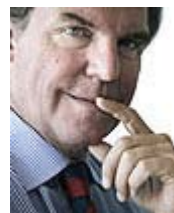
Nicholas Negroponte Chairman Emeritus, MIT Media Lab USA