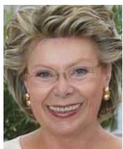
Viviane Reding European Commissioner, DG Information Society and Media Belgium