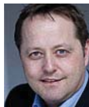
Jakob Axel Nielsen Danish Minister for Health and Prevention Denmark