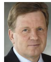
Esko Aho Former Prime Minister, Finland Executive Vice President, Corporate Relations and Responsibility, Nokia Corporation Finland